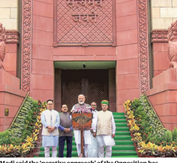
Modi said the 'negative approach' of the Opposition has prevented MPs from expressing their views and highlighting issues pertaining to their constituencies

in the first session of this Lok Sabha, an undemocratic attempt was made to scuttle the voice of the government that has been asked by 1.4 billion Indians to serve. For twoand-a-half hours, attempts were made to scuttle the voice of the Prime Minister and such a thing has no place in democratic traditions. They have no remorse over it," Modi said.